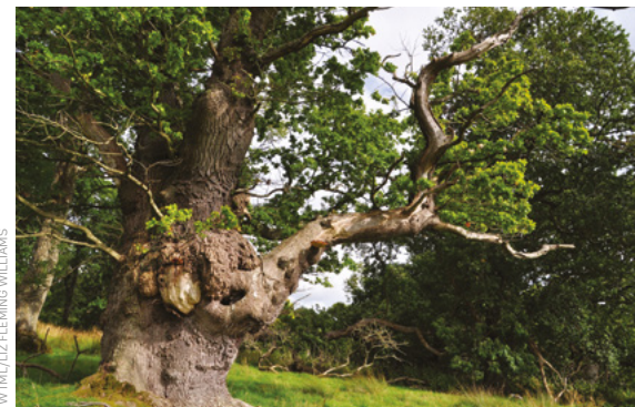
WTM/LUZ FLEMING WILLIAMS