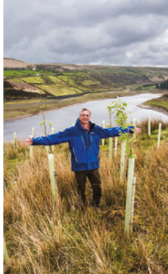
SPONSOR: THE FULDA

Heartwood, heroes and Her Majesty... here are our highlights from 2018 at the Woodland Trust